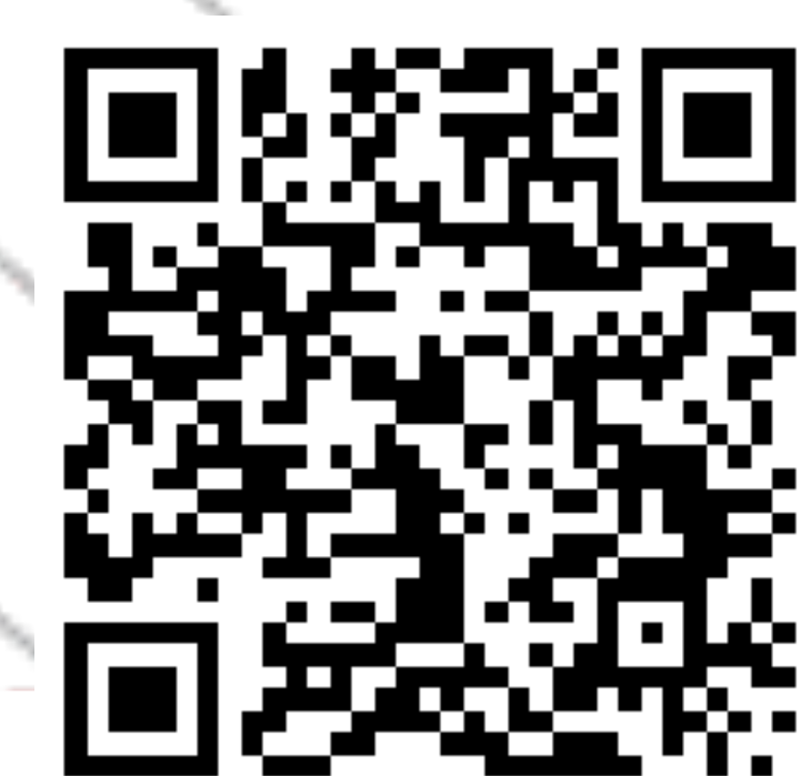
Plan du Micro-Salon